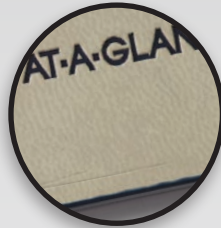
DURABLE TAN COVER