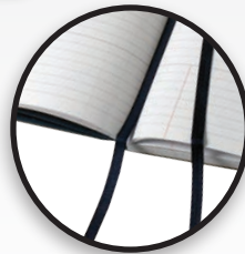
TAPED SPINE WITH RIBBON