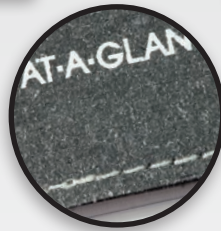
DURABLE HEATHER GRAY COVER